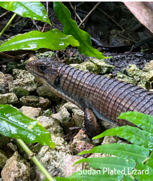
Sudan Plated Lizard